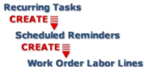
FLEETMATE Reminder System Hierarchy

An easy way to remember how reminders and tasks function is the following: